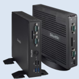
SLIM PCs Listed Are Fanless