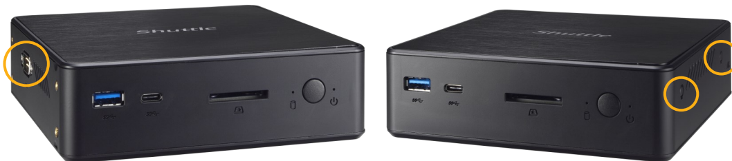
LEFT: RS232/RS422/RS485 port, RIGHT: WLAN antenna perforation

For more information on all products, please contact us at sales@us.shuttle.com or 626.820.9000